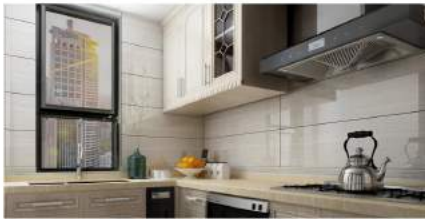
▲ Prefabricated kitchen with Diamond collection