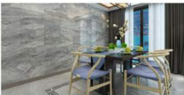
▲ Decorative wall panels with Diamond collection