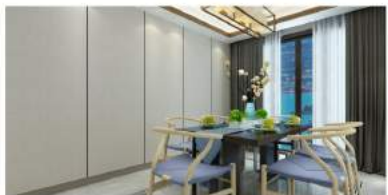
▲ Decorative wall panels with Multicolor collection